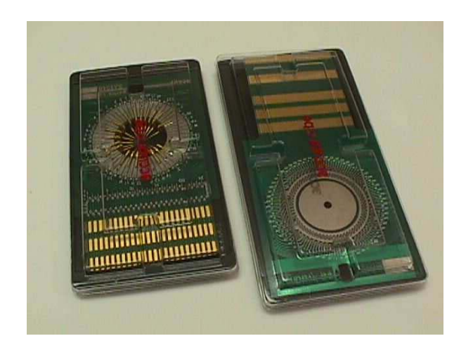
Probe Card Protectors